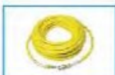
Respirator Airline Hose