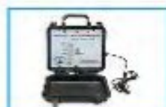
AirScan CO Monitor