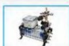
VisiFlo Premium Airline Filter