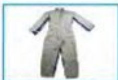
Leather Blasting Suit

Note: Regulatory requirements for breathing air supply quality specifications vary by region.