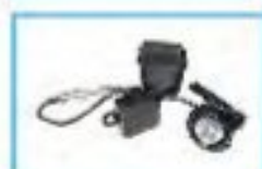
Aurora LED Helmet Light