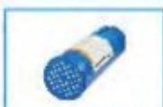
PBF Filter Cartridge