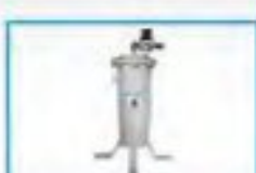
PBF II-1 Airline Filter